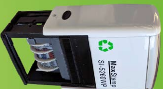
MAX STAMP DATER STAMPS