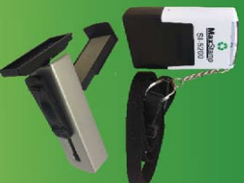
POCKET STAMPS & SMALL & CONVENIENT MAXSTAMPS WITH KEYRING