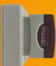
MAXLIGHT PRE-INKED STAMPS