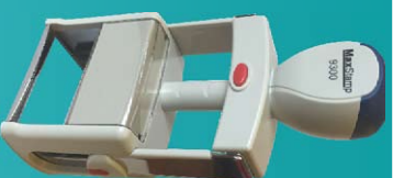
HEAVY DUTY STAMPS