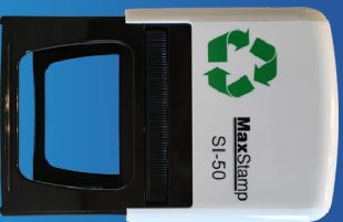
MAX STAMPS SELF-INKING STAMP