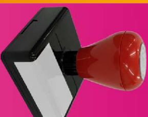
PRE-INKED PERMA STAMPS